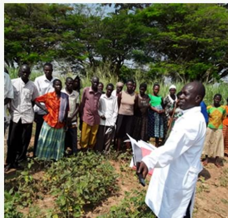
Farmers field day held at NaSARRI-NARO, January 2020

The project came to an end in May 2021, due to the conditions of the fields not being suitable to test the heat and drought tolerance of the STOL crops.