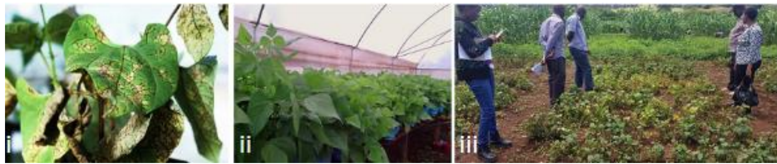
BCMNV symptoms on leaves (i); French bean breeding lines in the greenhouse (ii); field trials in KALRO Kakamega 2019 (iii).

Watare, G.W., 2023. Marker assisted Selection for resistance to bean common Mosaic Necrosis virus In French Bean cultivars in Kenya (Doctoral dissertation, UoEm).