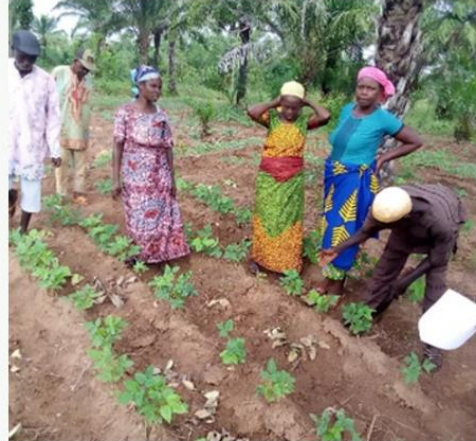
Farmers viewing cowpea lines during seed trials at Agbangnizoun, Benin

Summary: The UAC project began in January 2018 and KT provided financial support until February 2021. Several cowpea lines from KT-funded projects, IITA and local Benin varieties were multiplied and tested for Striga and aphid resistance in pot trials. The best performing varieties were taken forward for field trials. The best varieties (FUAMPEA 1 and 2, Komcallé, Agbloto, Apagbaala, IT00K-126-3) were then used for participatory variety selection. Following this the lines were multiplied in preparation for dissemination.